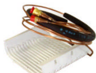
F1-2600 plate clw 12" of tubing

RT4 Freezer box 10.5 (267mm) long x 12.5 (317) high x 6.5 (165mm) wide