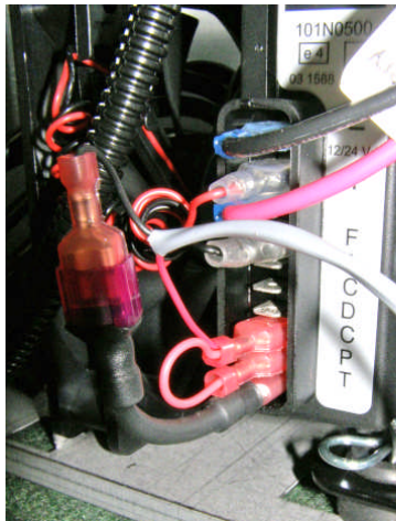
Photo shows unit wired with speed resistor in series with thermostat wire and reconnected to T