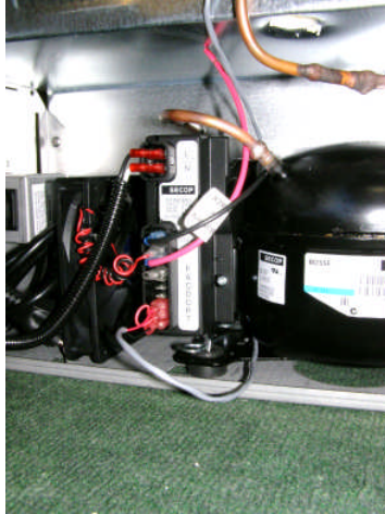
Photo shows unit wired for low speed. Thermostat is on C-red, P-red, T-black