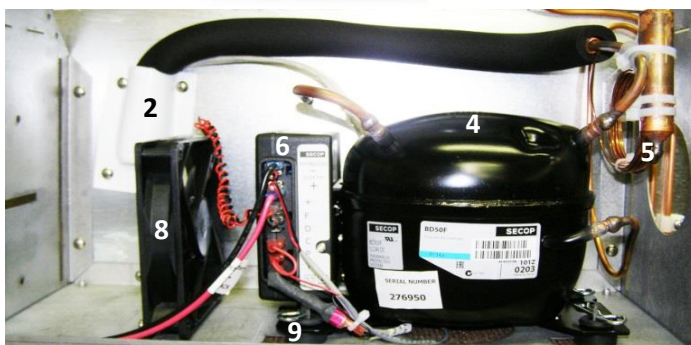
Base Expanded View